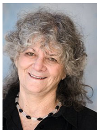
Ada Yonath Nobel Prize in Chemistry 2009 Weizmann Institute of Science Rehovot Israel

Saturday, July 24, 2021 17:00–18:00 From origin of life to modern medicine