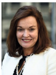
Carol Robinson Chemistry Physical and Theoretical Chemistry Laboratory University of Oxford United Kingdom