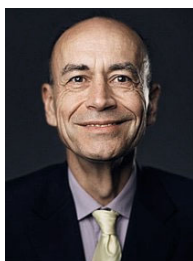
Thomas Südhof Nobel Prize in Physiology or Medicine 2013 Department of Molecular and Cellular Physiology Stanford University School of Medicine, USA

Saturday, July 24, 2021 17:00–18:00 From origin of life to modern medicine